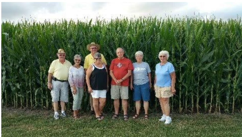
That's some pretty tall Iowa Corn!!